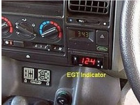
Indicator installed in Land Rover Discovery

The indicator is able to display the current EGT plus the maximum and minimum values recorded .