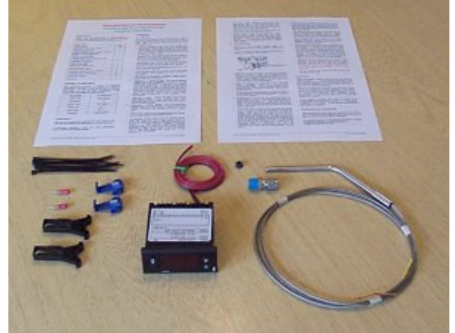
Universal EGT Kit contents

The kit contains all the components needed to install a fully functional EGT indicator.